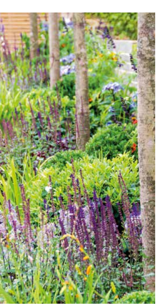
Above: Structural evergreen planting like Pittosporum tobira `Nanum' and Ilex crenata 'Dark Green' (replacement to Buxus sempervirens) punctuated with repetition of herbaceous planting forms and colour

Southgate Timber Company Limited, southgatetimber.co.uk